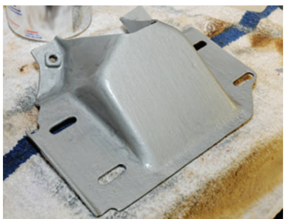
■ The front side would look fine in this paint, and it would be perfectly protected. But black is correct for our engine bay.

if the rust won't stick to the underlying metal, any kind of coating will come off as the rust flakes off. So start by spraying on the Metal Blast cleaner, then let it work for anywhere from 20 minutes to a couple of hours. Give it some more applications and scrub the part to help loosen the surface rust and any other grime. Then rinse with water to check your results.