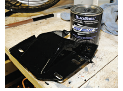
■ The BlackShell coating goes on glossy and should dry glossy. Be careful when testing it for dryness, we put a couple fingerprints into the paint when it was still tacky!

suspension components, yielding a gloss black finish that is resistant to moisture, abuse and to UV if it's subject to direct sunlight. The BlackShell topcoat goes on with the brush just like the base coats.