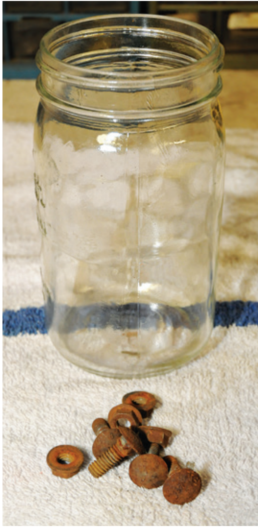
These are the fasteners for our test panel. We'll just get them de-rusted by soaking them in Metal Blast in a mason jar.

We sourced our conversion kit from a Corvette junkyard and like most junkyard parts, the plates and brackets are all