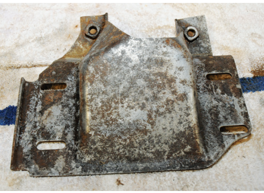
Within an hour, our panel looks like this. The loose rust is all gone and when it's drv. it will be ready to paint.