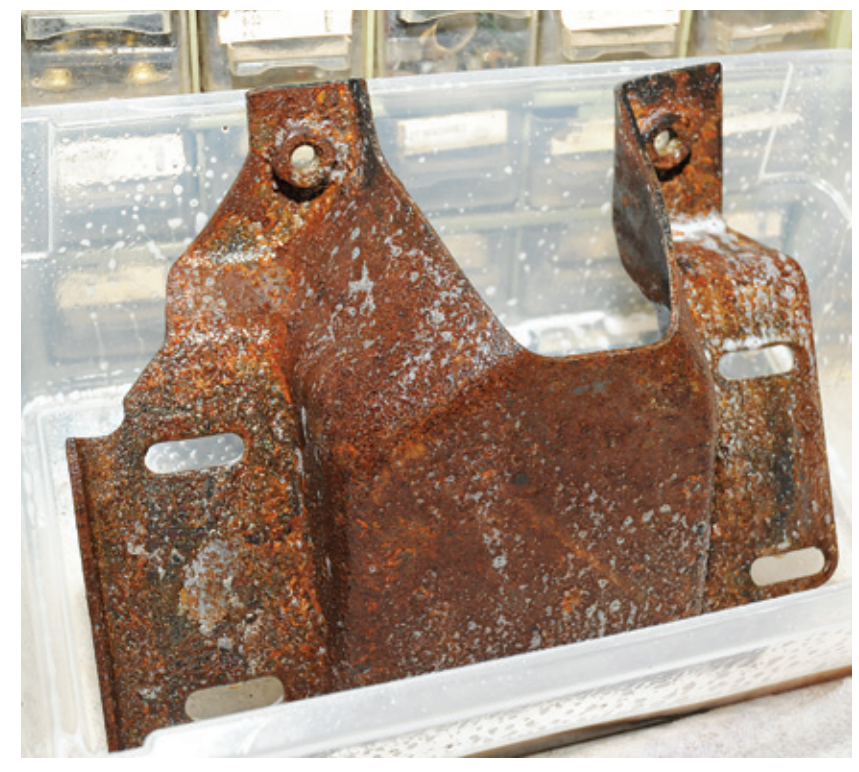
■ The front side gets the same treatment. Keep it wet with Metal Blast from the spray bottle.

THE WATER/MOISTURE ACTUALLY CURES RUST BULLET INTO AN ARMOR-TOUGH FINISH. BY DEHYDRATING THE STEEL AND THEN ENCAPSULATING IT IN POLYURETHANE. NO NEW OXYGEN CAN GET TO THE METAL TO CREATE ANY MORE RUST.