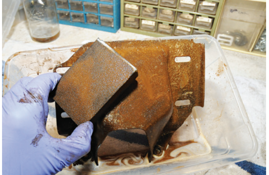
After about 20 minutes, we worked on the panel with the scrubby to get some of that loose rust off.