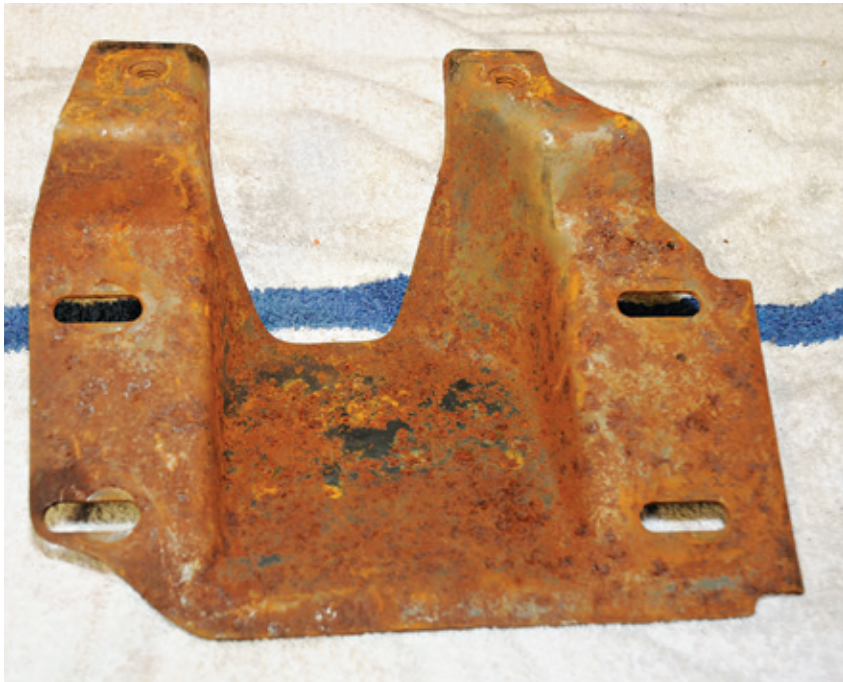
■ This panel is as rusty as a junkyard part can be. But we'll get it ready to dress up our firewall and last forever.