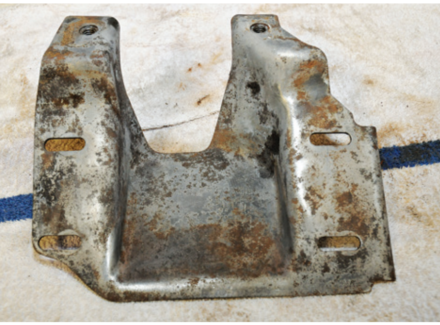
The backside looks just as good as the frontwe're ready to paint!

thane shell that seals your metal parts against the elements.