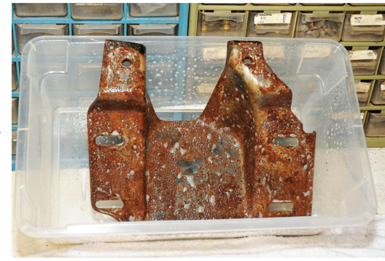
We put the panel into a plastic box to keep the Metal Blast under control. Spray it down thoroughly and reapply a squirt if it dries.