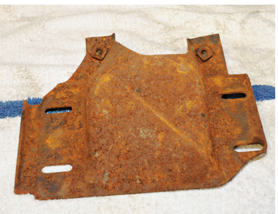
Here's one side of the panel, and it's as bad as the other one. This is going to take some serious work.