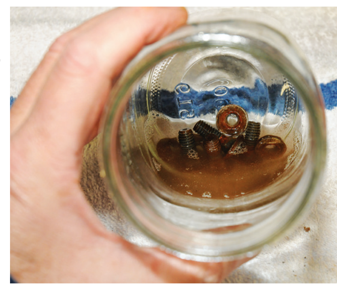
■ You can see the rust starts to come off the fasteners immediately on contact with the Metal Blast.

The Metal Blast cleaner uses phosphoric acid to dissolve surface rust, and has some detergents and corrosion inhibitors to help it clean metal effectively. The best thing about this stuff is that cleanup and neu-