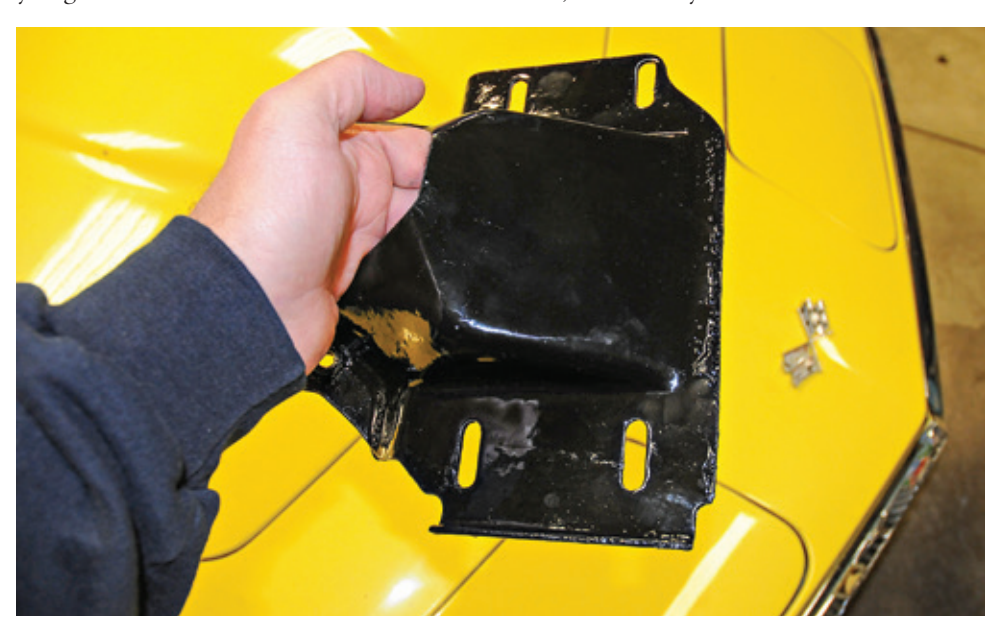
■ The finished product is hard, and will last indefinitely in this car. Note that we plan to run a chase through the threaded nuts welded to the panel before installation. There's no good way to keep paint out of the threads, so we'll fix that later.

The bottom line is that we recommend Rust Bullet products. We use it on our own cars, and that says it all. Mi