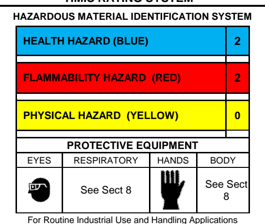
Hazard Scale: 0 = Minimal 1 = Slight 2 = Moderate 3 = Serious 4 = Severe * = Chronic hazard